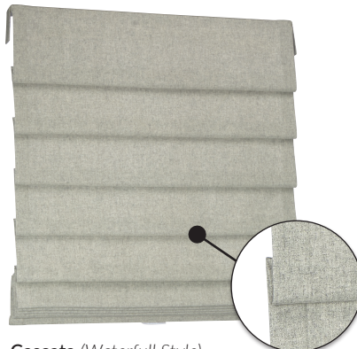
Cascata (Waterfull Style)

Pockets on the back of the shade support rods and form attractive seams on the front of the shade. Binded Pleat shades are not recommended with fabrics that have a pattern. They work best with solid or textured fabrics.