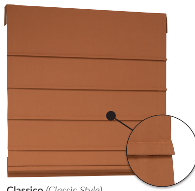
Classico (Classic Style)

Flat Roman Shades are perfect for large, bold or striped patterns. The flat folds have no stitching that would interfere with the patterns and the result is a tailored look that is perfect for a clean modern profile.