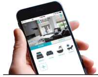
Automate™ Advanced Motorization Technology Compatibility

Control your shade with our standard child safe cordless operating systems or bead chain with available safety shroud. Also available is Automate™ motorization for hands free control with the app on your smart phone, connected tablet or smart home device.